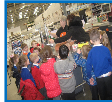
We went to B & Q to learn about materials.