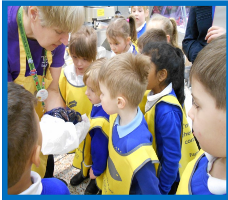
We went to Tesco to learn where our food comes from.