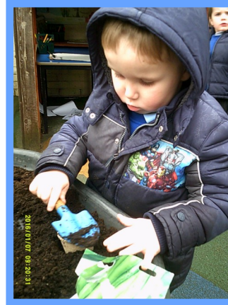
We planted seeds and watched them grow.