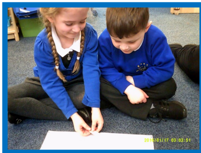
We have been reading simple words and sentences together.